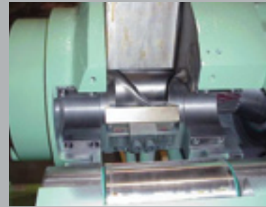
Optional drawer feed section for easy cleaning.